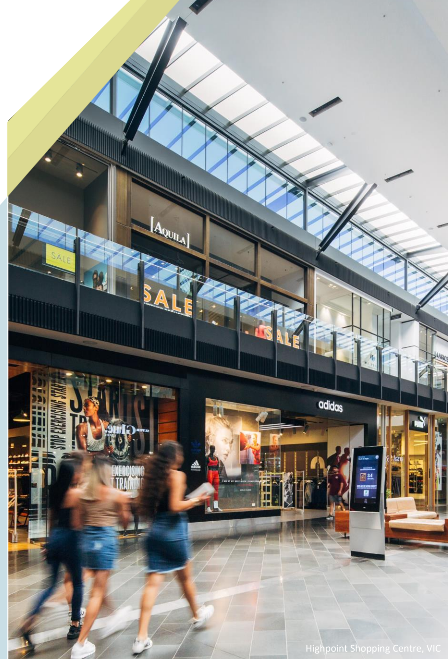
Highpoint Shopping Centre, VIC