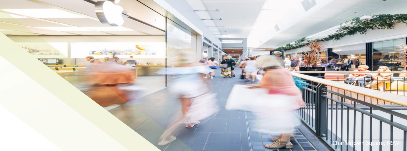
Charles Town Square, NSW