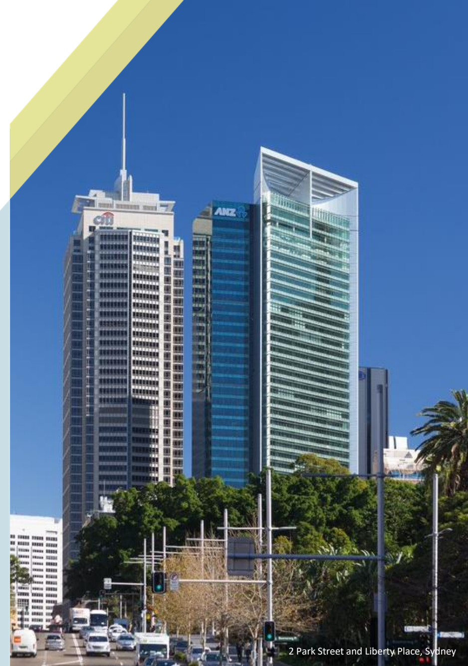
2 Park Street and Liberty Place, Sydney